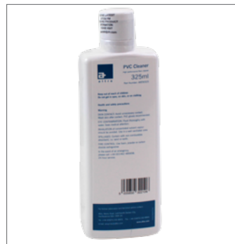
P/N: ALW A859/325 Altro Whiterock PVC Cleaner