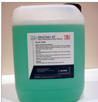
P/N: ASF 44 Cleaner Altro Clean 44 - 5 Liters 1.3 Gallons

The following maintenance products are available to purchase