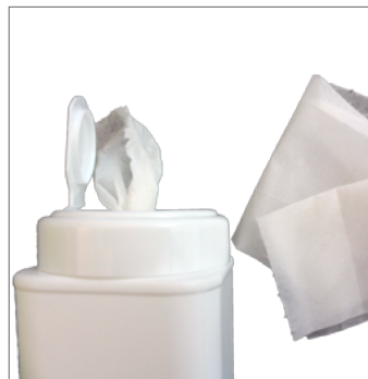
P/N: ALW A863 Altro Whiterock Anti-Static Wipes 80/Unit